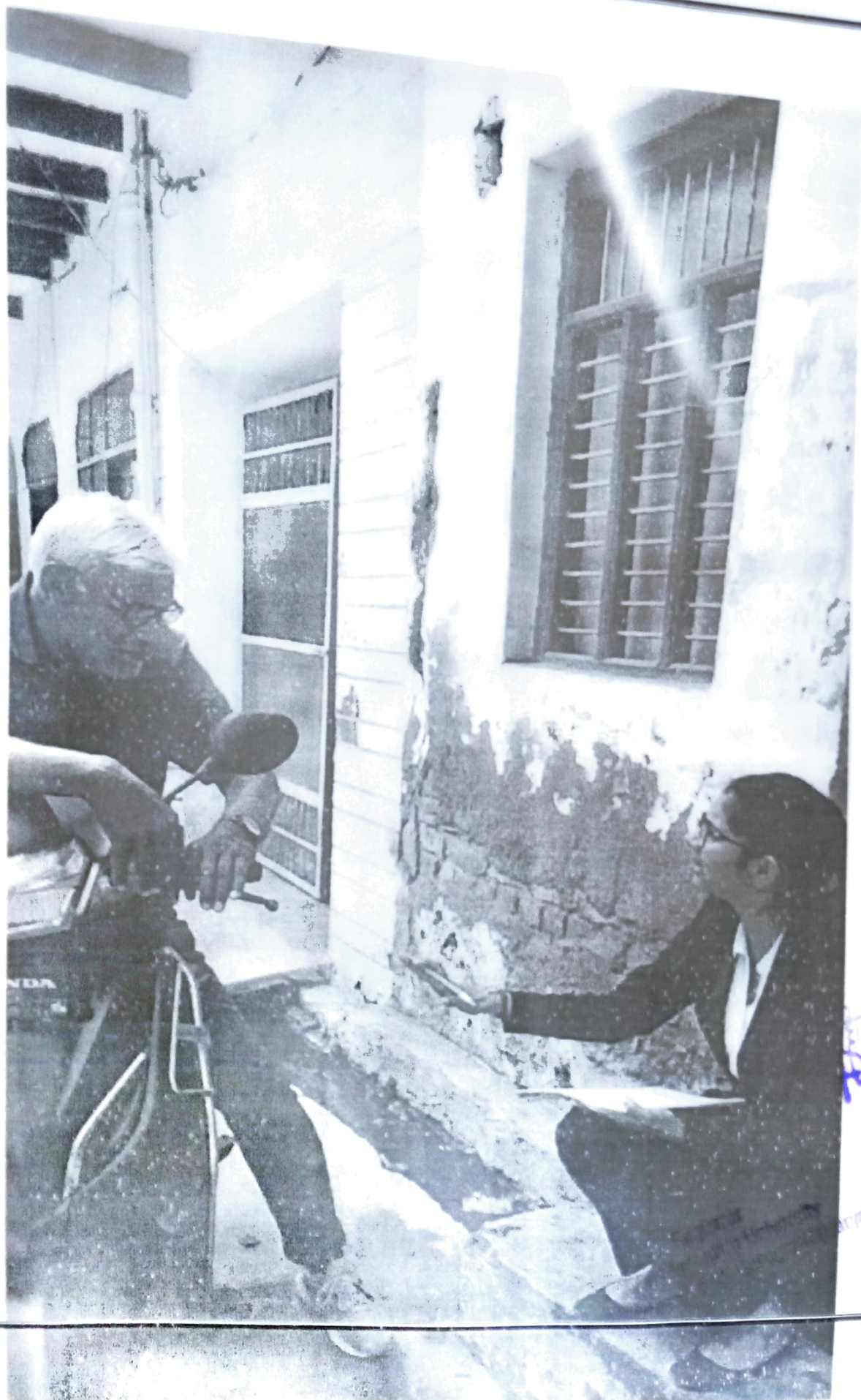
Dr. Manigulam University Gothia Road Gurugram (Haryana)